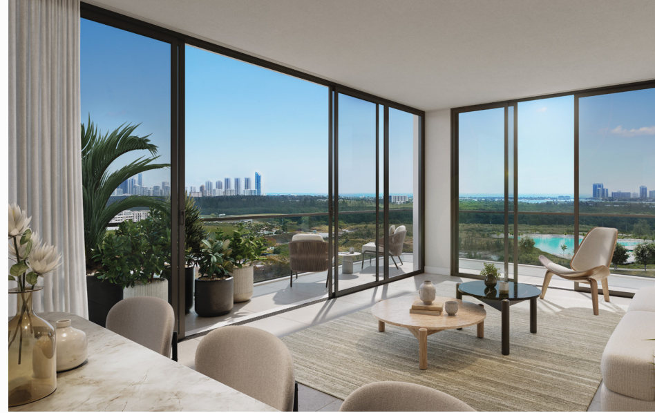
A new dimension in open-air living where indoors and outdoors seamlessly merge, Nexo Residences are in tune with Miami's tropical vitality and the nature that surrounds it.