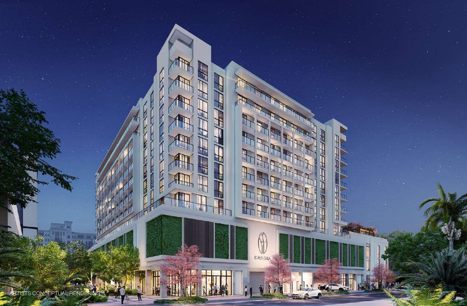
ARTISTS' CONCEPTUAL RENDERING