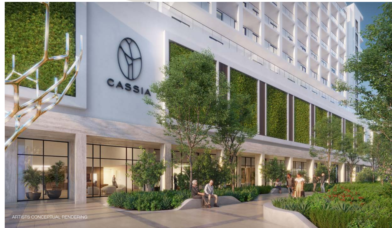
ARTISTS CONCEPTUAL RENDERING