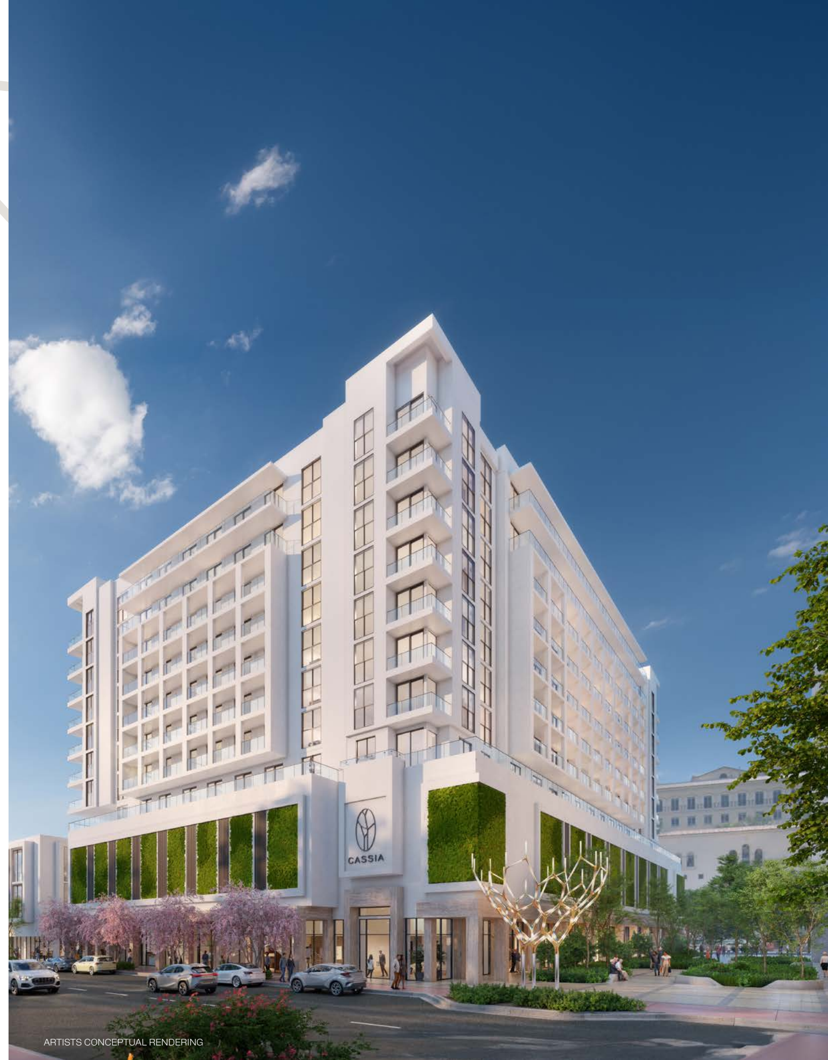
ARTISTS CONCEPTUAL RENDERING