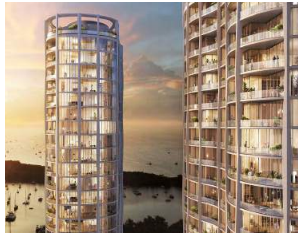
Park Grove, Coconut Grove, Florida