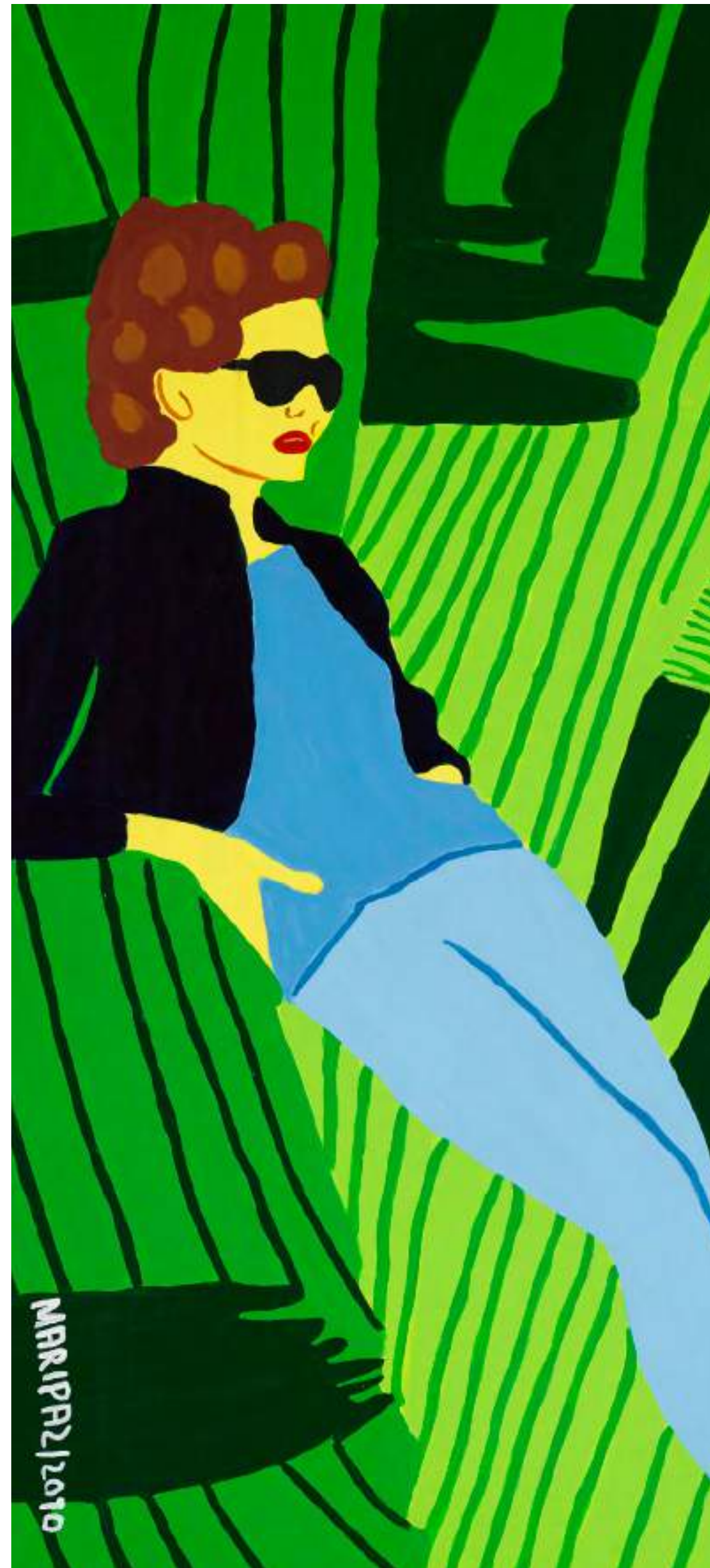
Maripaz Jaramillo (María de la Paz, b. 1948, Colombia) Ellas, 2010 Acrylic on canvas. 47 1/5 x 23 3/5 inches