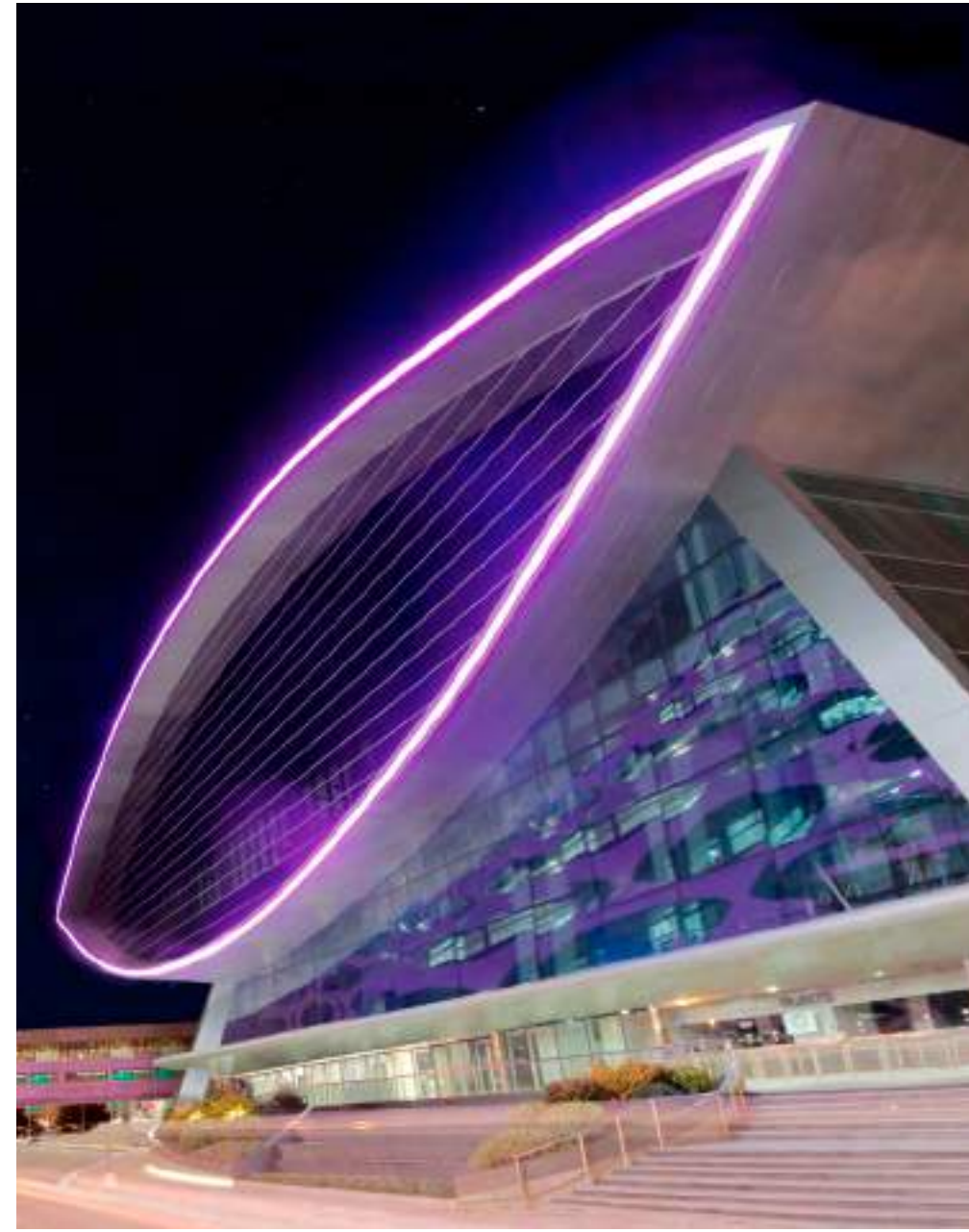
Manila Arena + SMX Convention Center, Manila, Philippines