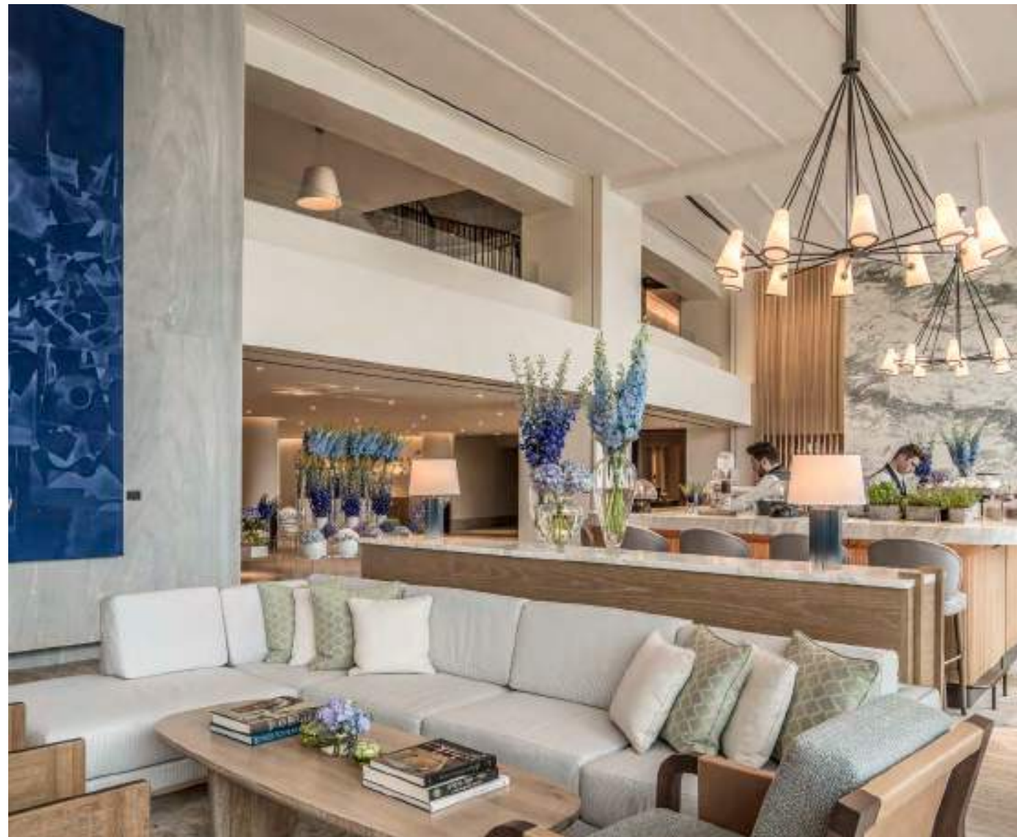
Four Seasons Astir Palace Hotel, Athens, Greece