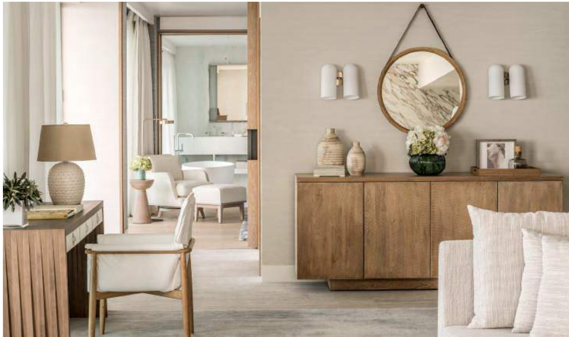
Four Seasons Astir Palace Hotel, Athens, Greece