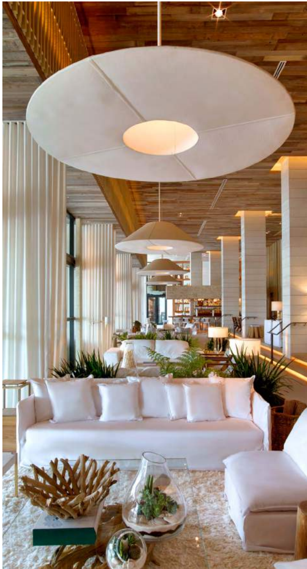
1 Hotel, Miami Beach, Florida