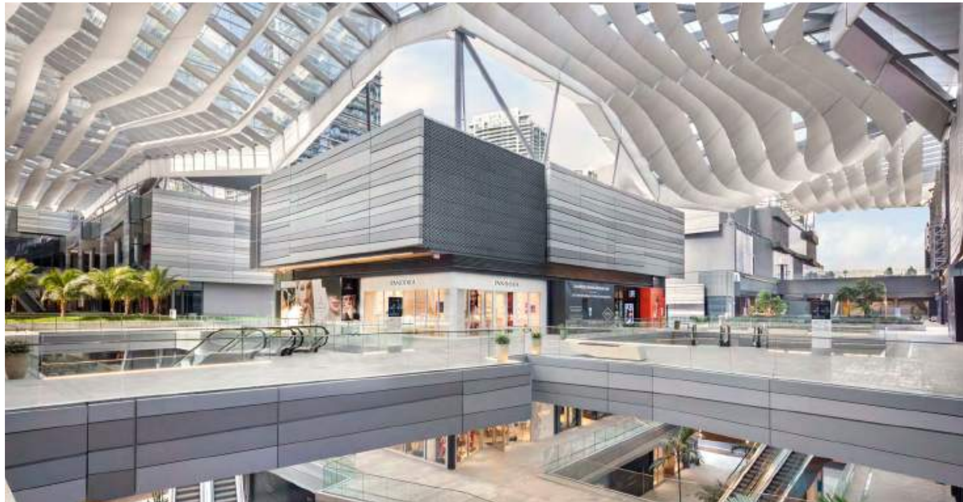
Brickell City Centre, Miami, Florida