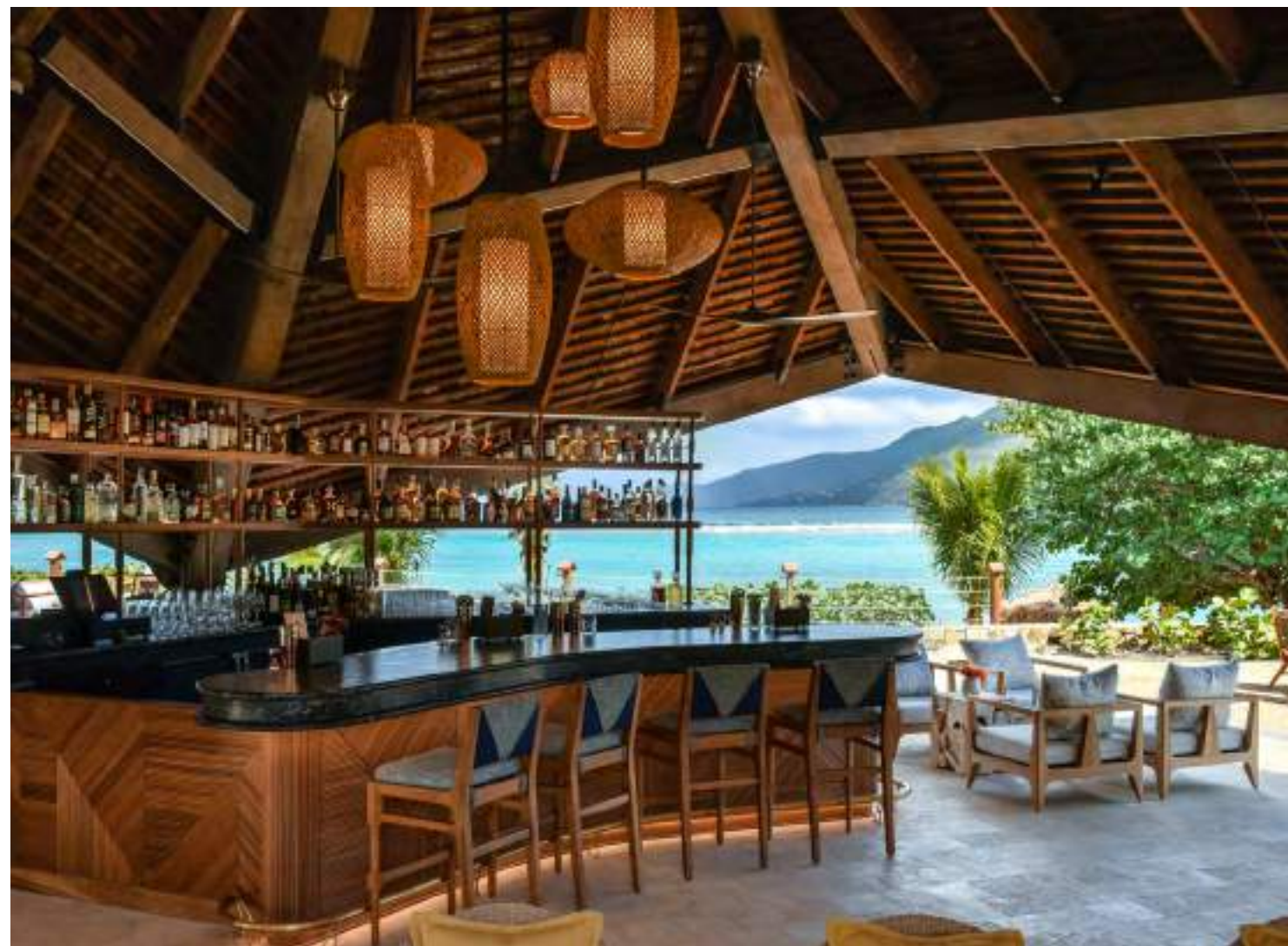
Rosewood Little Dix Bay, Virgin Gorda

Meyer Davis' vast portfolio combines bold design moves with striking details .