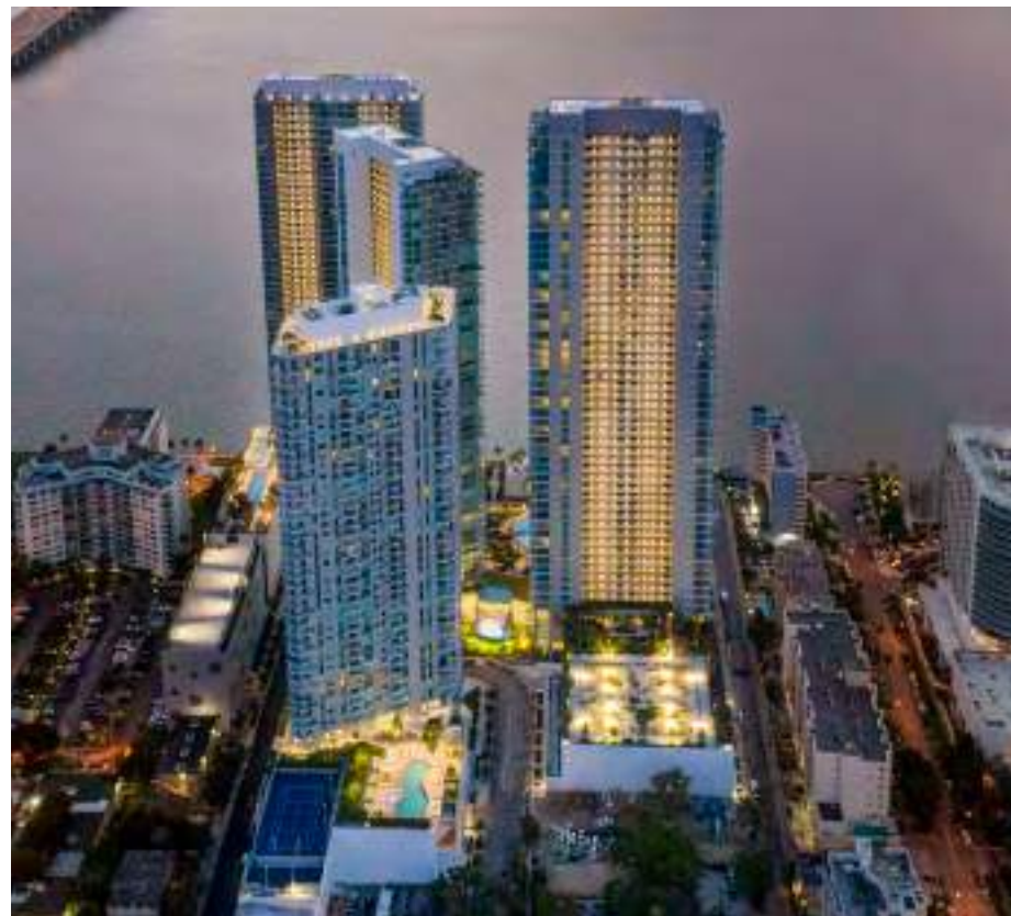
Paraiso District, Miami, Florida