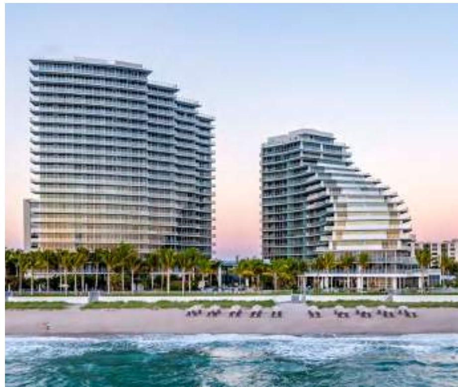
Auberge Beach Residences & Spa, Fort Lauderdale, Florida