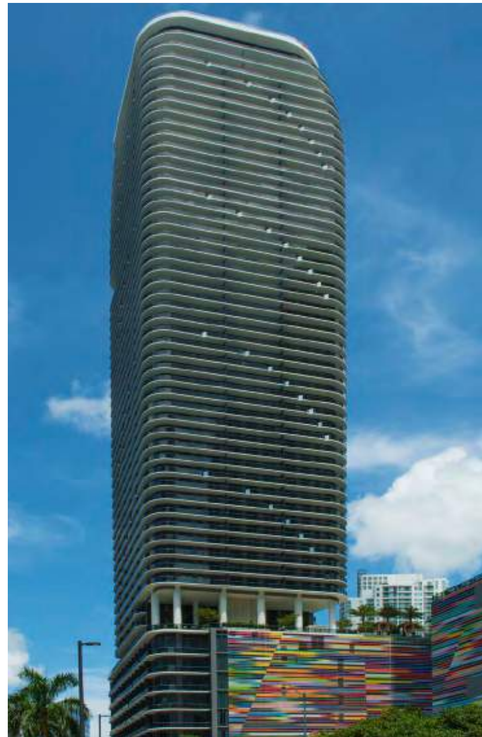
SLS Lux, Miami, Florida