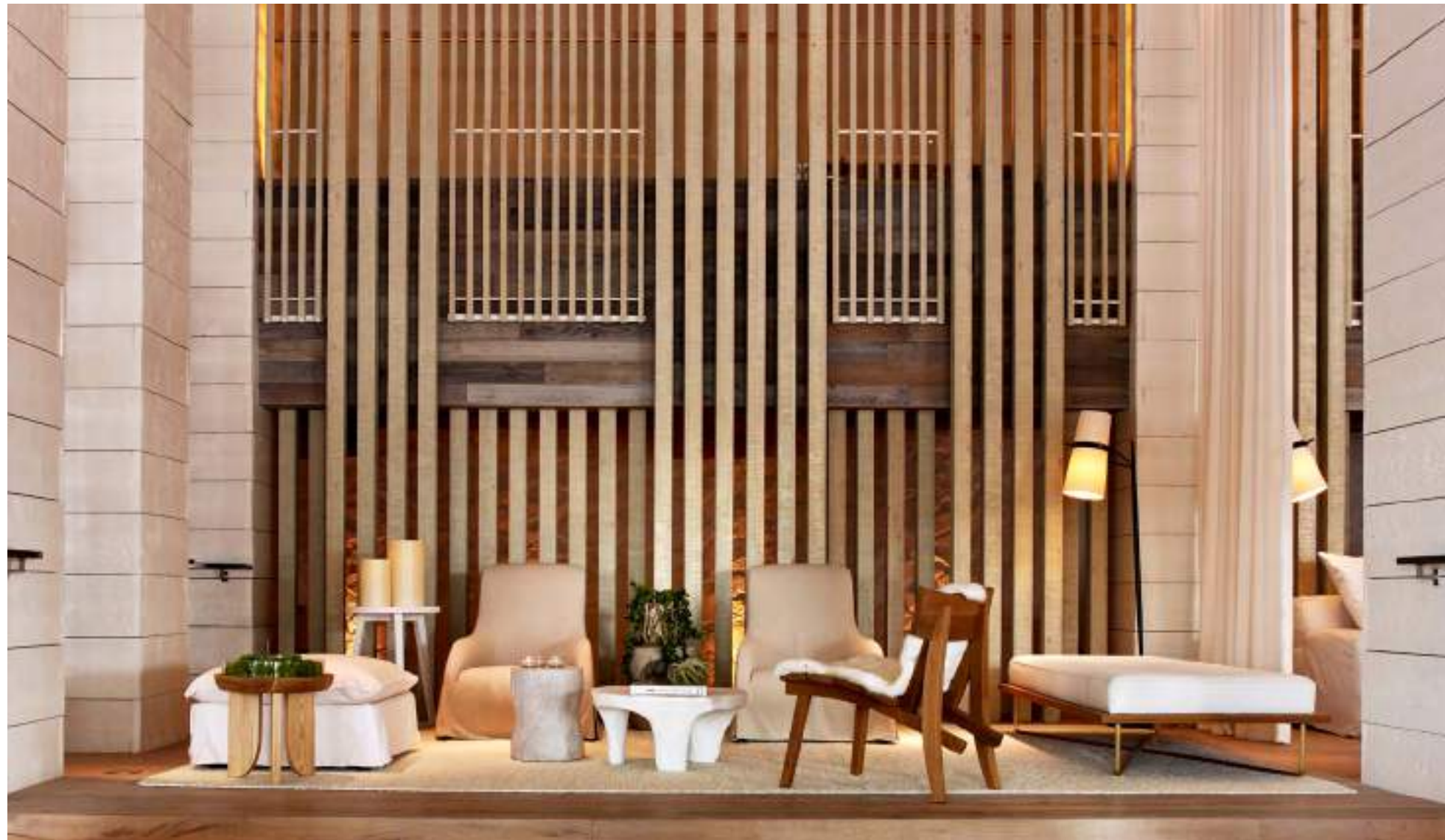
1 Hotel, Miami Beach, Florida