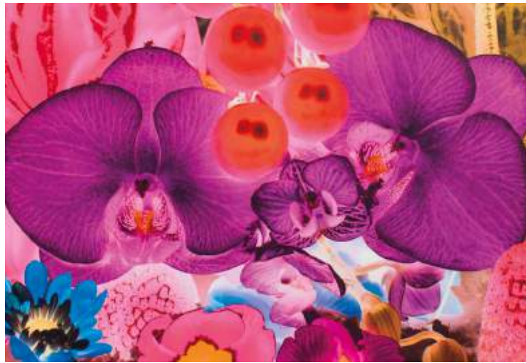
Marc Quinn (b. 1964, United Kingdom) At the Far Edges of the Universe, 2010 Seven digital pigment prints in colors. 27.5 x 41 inches each