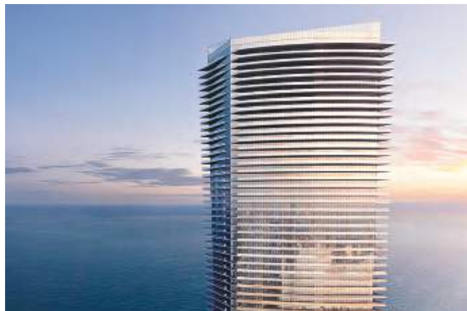
Residences by Armani Casa, Sunny Isles Beach, Florida