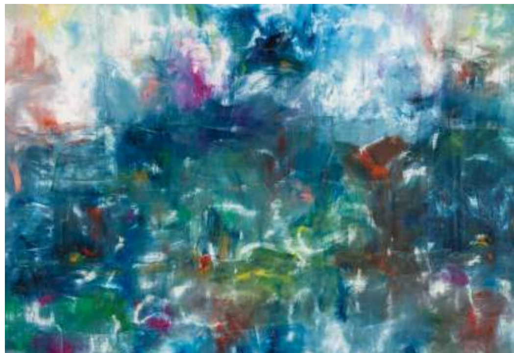
Dan Rees (b. 1982, United Kingdom) Artex Painting, 2013. Oil on canvas. 119 x 159 inches